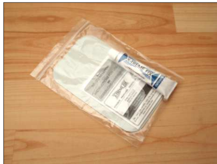
30027 Colour: grey