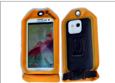
30038 A telephone case Protects against running water and also against short immersion in water.