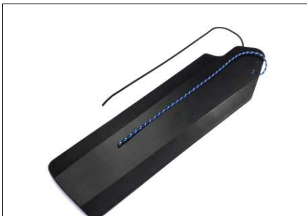
30010 Rudder blade