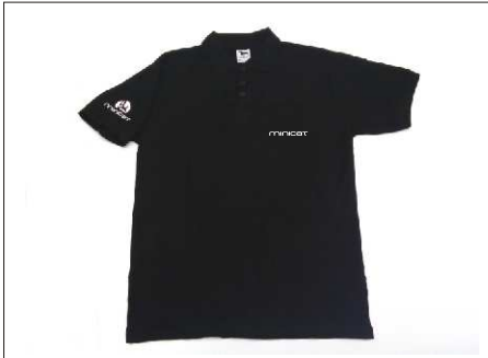
10404 Polo shirt L ; XL Black ; Red