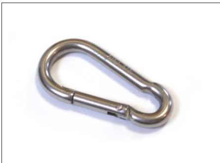
30019 Spring hook 50x5 mm