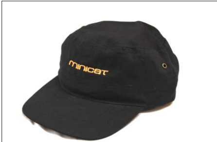
10502 Black Cap