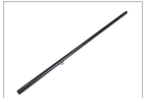
30009 Side tube Diameter 25 mm , Aluminium