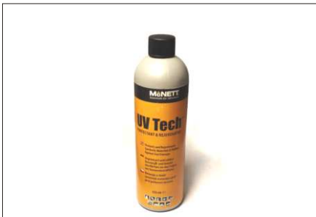
10510 UV Tech Protectant & Rejuvenator 355 ml