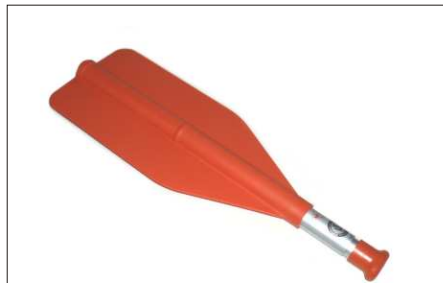
30039 Telescopic Paddle Length 500 - 1150 mm.