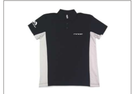
10406 Polo shirt L ; XL