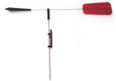
30032 Wind Flag

Indicator of wind direction on the top of the mast.