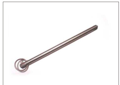
30018 Rudder pin