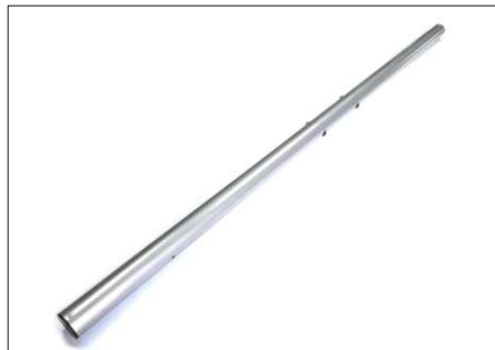
30007 Cross tube - front 30008 Cross tube - rear Diameter 45 mm , Aluminium