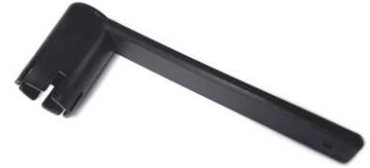
30025 Valve Wrench