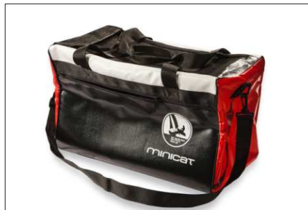
30042 MiniCat Bag Plastel 500 x 300 x 250 mm