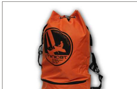
10506 Sailor Bag