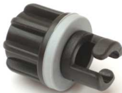
30030 Adapter for Valves

Pump commutable from double action to single action (works while pushing only).