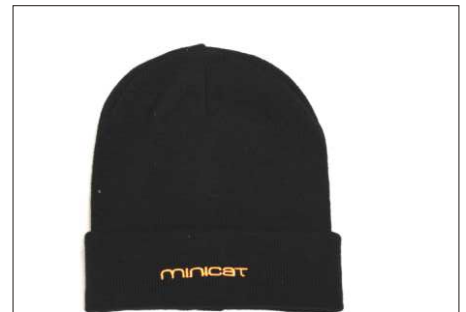
10501 Black Woolly Hat