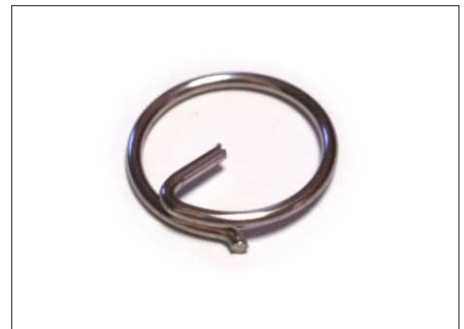
30022 Retaining Clip