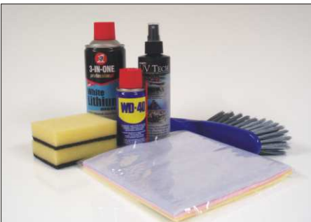
30041 MiniCat Maintenance Kit