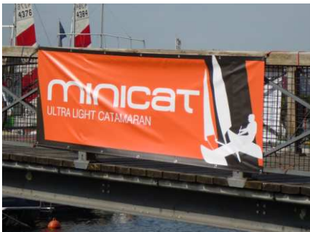
10508 Banner MiniCat