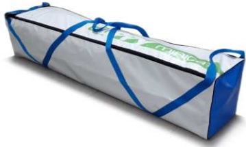
30023 Minicat Bag 1400 x 300 x 400 mm