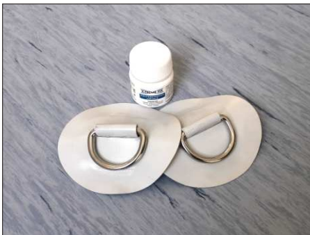
30026 D-rings with glue