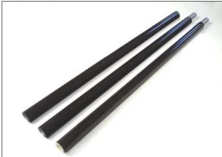
30013 * Mast

* 1 - lower part, 2 - centre part, 3 - upper part