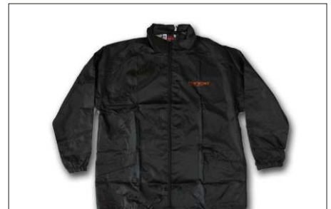
10507 Wind Proof Jacket