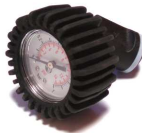
30031 Pressure Gauge