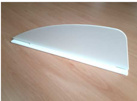
30016 Keel fin