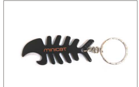
10504 Fish Key Ring