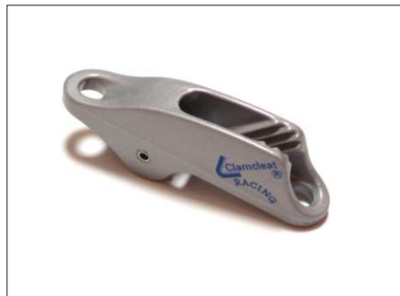
30021 Jib cleat