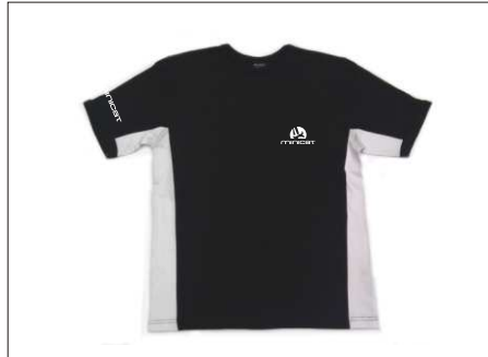
10405 T-shirt L ; XL