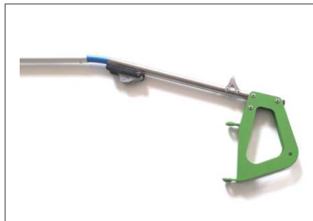
30011 Rudder assembly