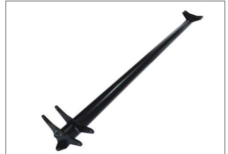
30005 Center frame