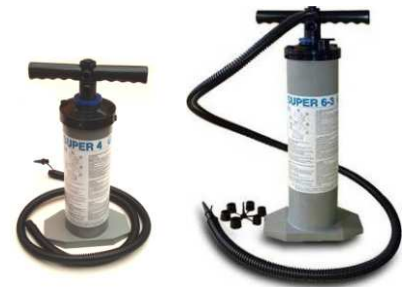
4 litres 6/3 litres