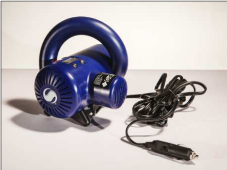
30033 Electric pump 12 V The compressor powered by a car battery