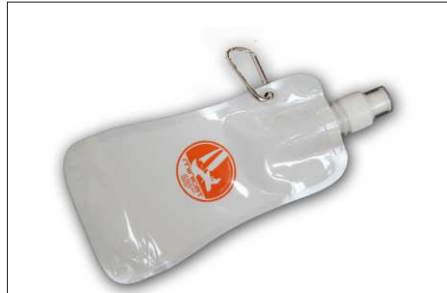
10503 White Water Bottle