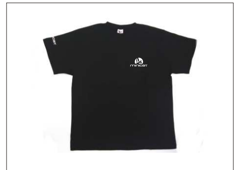
10403 T- shirt