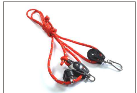
30012 Fiddle Block, Cleat